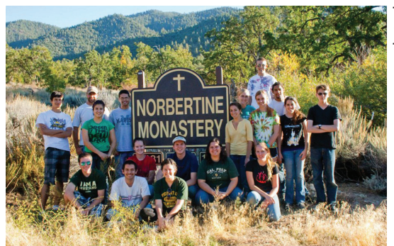
Thank you CAL POLY NEWMAN CENTER work party volunteers!

To find out more about our cloistered contemplative Norbertine way of life, to make prayer requests, to find out about our vestments, gift shop inventory and hours, or Bethany Guest House, you are welcome to phone (661) 823-1066 or use our email accounts: pray_req@cybersurfers.net or MotherMaryA@aol.com (If you do not receive an acknowledgement of your message, please resend it or call.) Also, please kindly assist us in updating our address and email database by sending us your current information! Please check <a href="https://www.norbertinesisters.org">www.norbertinesisters.org</a> for the downloadable version of this newsletter in color. Thank you to all who make this newsletter possible! References are available upon request.