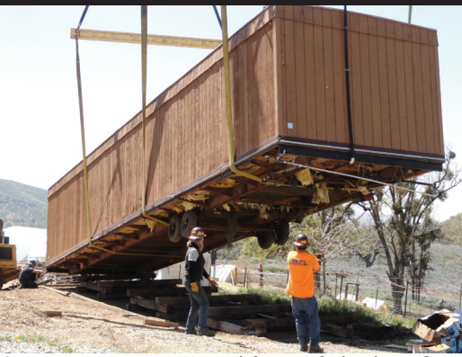
Numerous prayers were said for a safe landing of our modular trailer Novitiate building.

Some Pre-Construction Work (Pray that all may be in place for "ground-breaking" in the spring!)